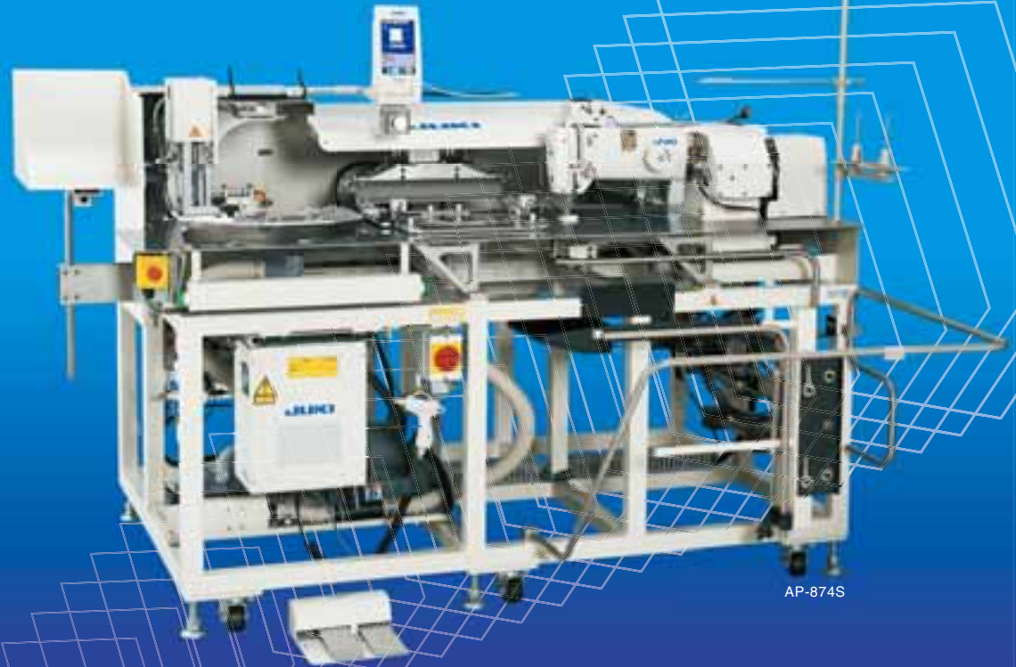
Jeans Pocket Setter (Semi-auto type)

The AP-874 is a state-of-the-art sewing machine which achieves consistent quality and higher productivity.