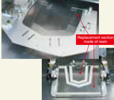
Pocket presser plate